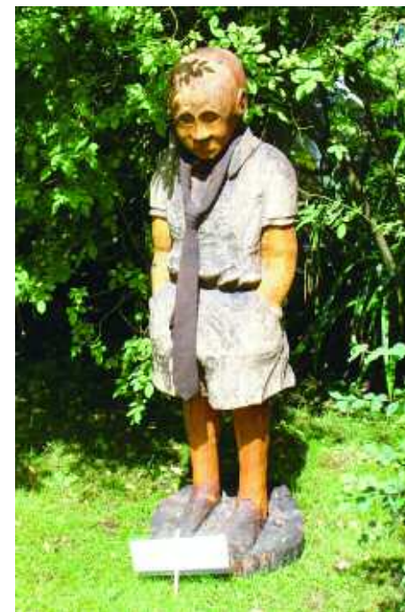
Art in the Garden - Delicious teas will be served daily Weekends 11am to 4pm Weekdays 2pm to 4pm

The information contained in this brochure is correct at the time of going to press but the Lymm Festival Management Committee reserve the right to alter or cancel events should this prove impossible to avoid